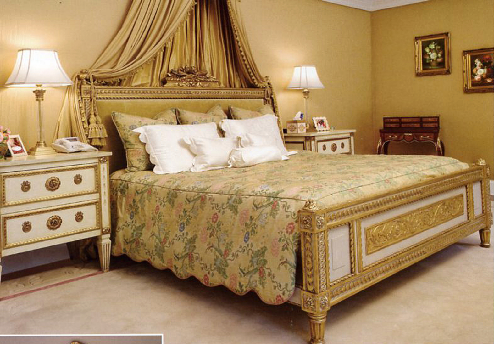
Above: A regal and tranquil haven, the master bedroom features a hand-carved gilded bed, upholstered walls, and rich fabrics. Left: A charming bedroom offers the cozy shelter of a faux four poster bed, fashioned from floral chintz.