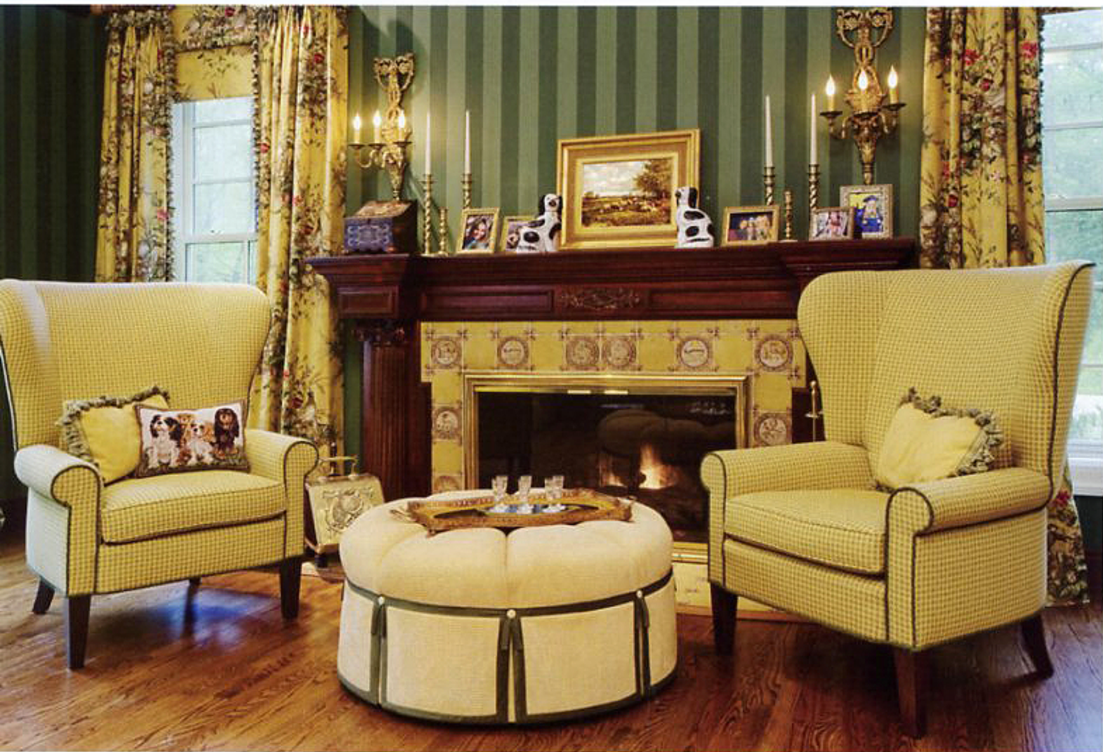
Above: In the family room, comfortable wing chairs provide a cozy spot for reading or conversation. Below: In front of a curved wall in the guest powder room, a wooden column holds a hand-painted gilded sink.